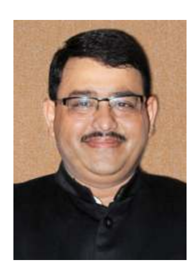
From The MDs Desk